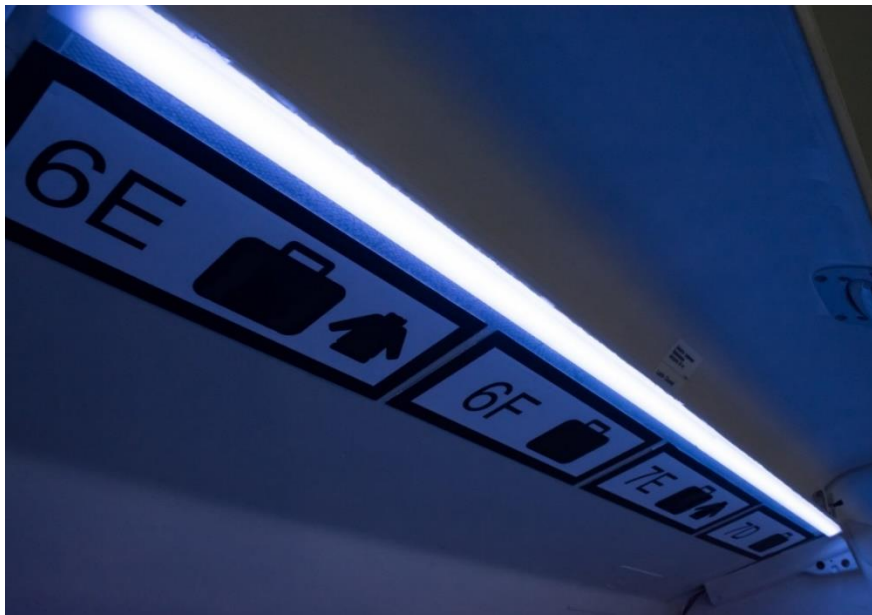
Figure 2. Luggage divisions including a light strip, an outline, seat number, and icon.

Before being able to find the best spot and the optimal loading of the bins, passengers are asked to provide the airline with their hand luggage dimensions while booking their ticket or checking in (on the application, the website, or at the check-in desk). Passengers who provide the airline with this information can/will board first. An algorithm calculates the optimal hand luggage division in the overhead bins to make these fit. Passengers, for whom the luggage will not fit, will be asked to check-in their hand luggage.